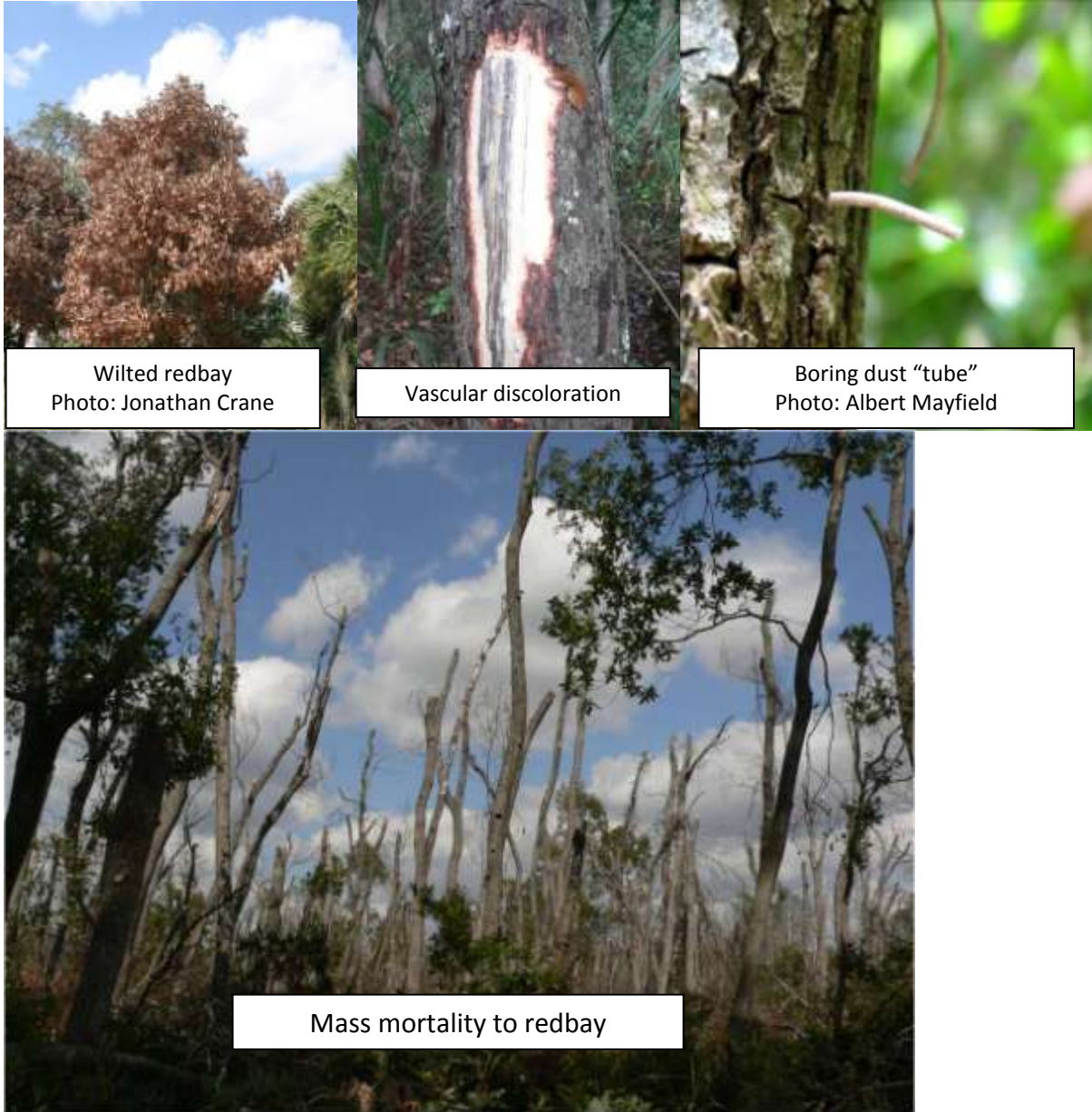
Photograph 1. Leaf, wood, and bark symptoms of laurel wilt and redbay ambrosia beetle attack of redbay trees.