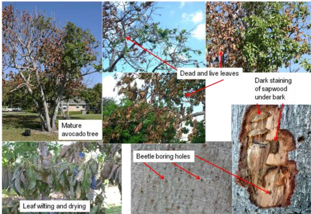
Photograph 2. Symptoms of a mature avocado tree that tested positive for laurel wilt and redbay ambrosia beetle in Brevard County.

More information on the laurel wilt-redbay ambrosia beetle may be found at: University of Florida/IFAS –